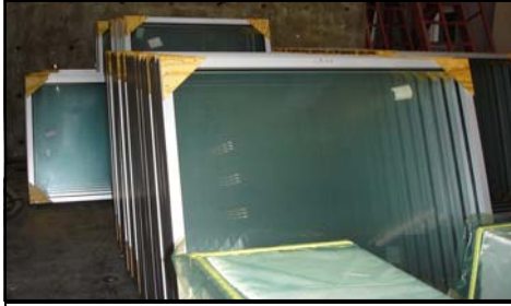
Windows Readied for Testing

After much research showed there was no recent standard testing protocol which had been scientifically established for the testing of glazing materials' performances during earthquake events, the window film industry commissioned a research project to (1) develop such a test method which would be acceptable to the engineering community and (2) to actually test windows with and without window film applied in various ways.