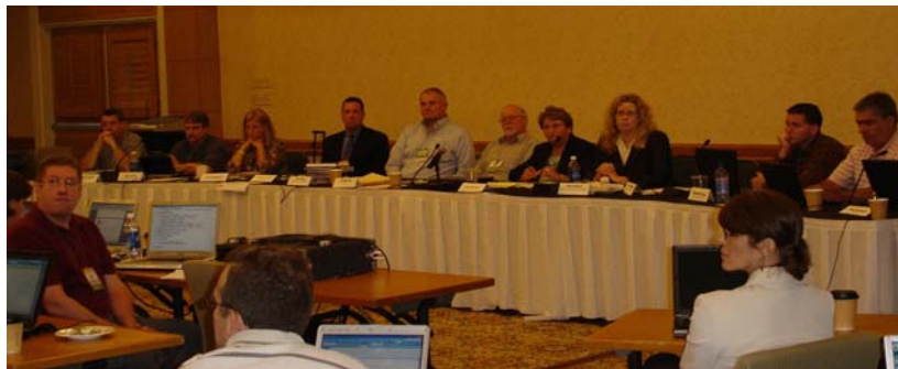
NFRC Board of Directors listen to comments from the audience at Tempe, Arizona meeting in November, 2007.