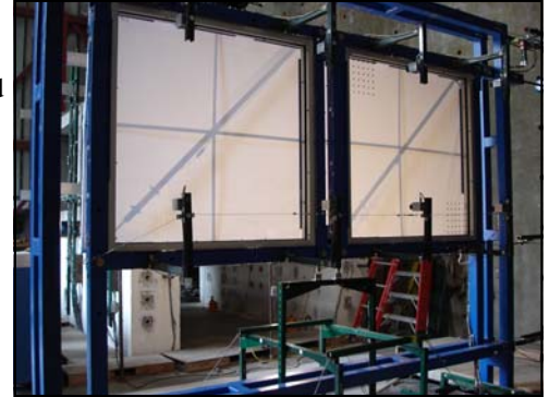
Seismic Testing Apparatus

After much research showed there was no recent standard testing protocol which had been scientifically established for the testing of glazing materials' performances during earthquake events, the window film industry commissioned a research project to (1) develop such a test method which would be acceptable to the engineering community and (2) to actually test windows with and without window film applied in various ways.