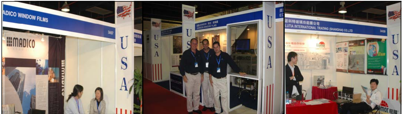
Madico Inc., Johnson Window Films, and CPFilms, Inc. all participated in the China Fenestration Show