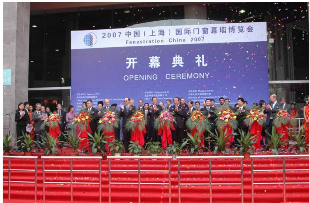
Grand opening ceremonies at tradeshow in Shanghai.