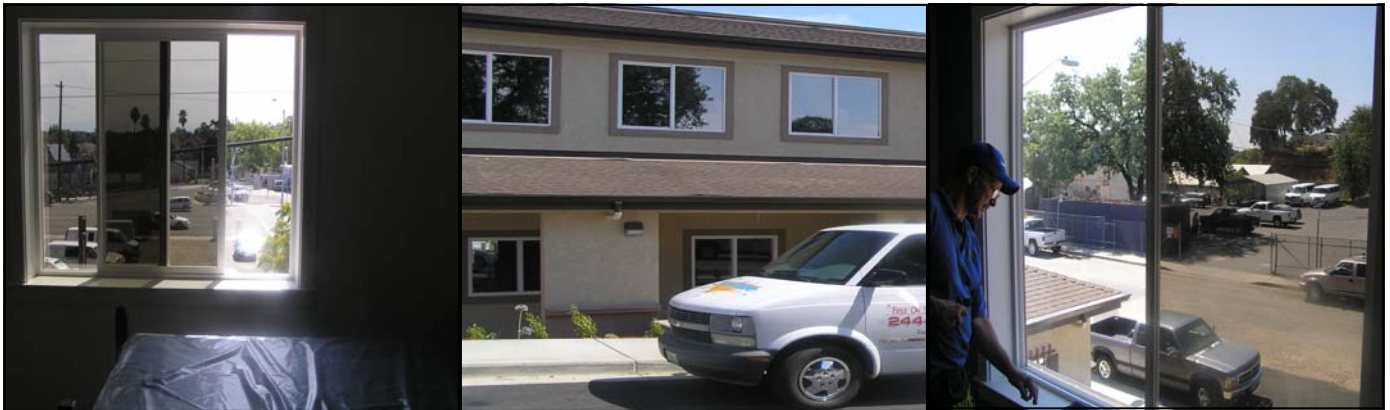
The Goodnews Ressue Mission in Redding created a wonderful avenue for positive public relations

We know that many others also perform this type of public service at times. If you are involved in these good-will activities, write them up and send them (along with pictures, if possible) to the IWFA at admin@iwfa.com . If you have not been involved, then contact your distributor and manufacturer for opportunities to do so!