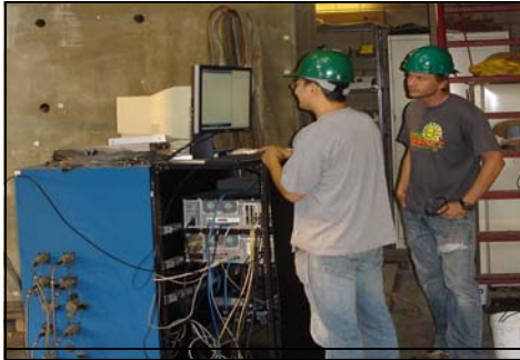
Technicians Preparing for Test