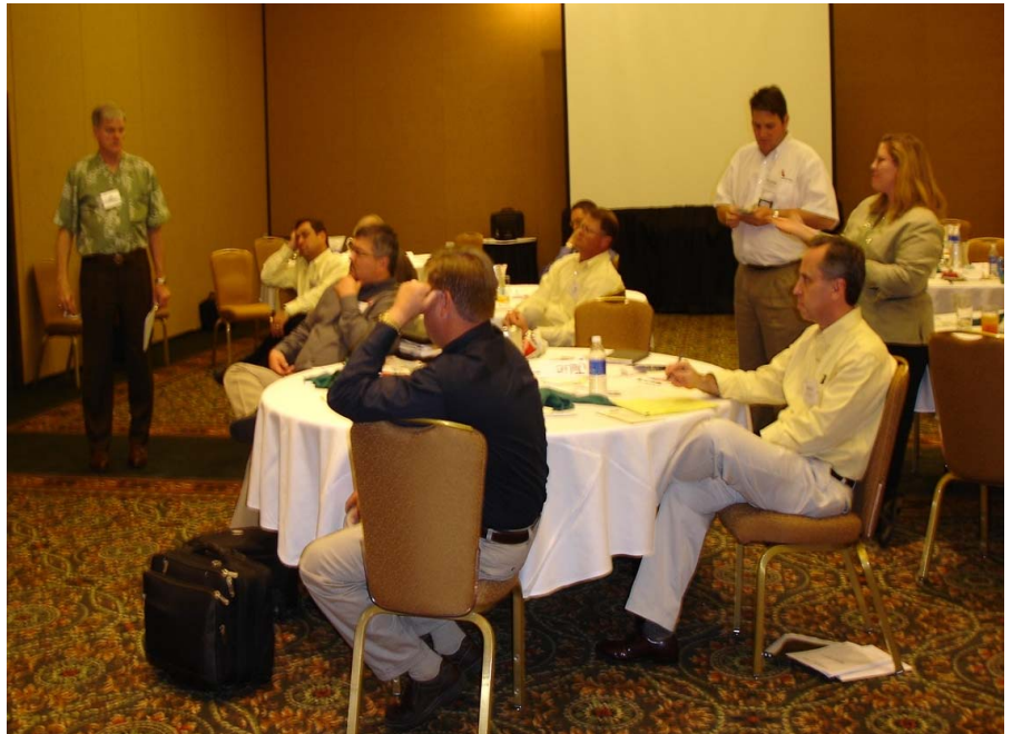
PGC workshop meetings during 2007 promoted taking a fresh view at the organization by its leadership and other involved members.

For the Protective Glazing Council (PGC), the past year of 2007 was a year of tremendous change. Strategic assessment workshops were held during the year with a professionally led group of PGC board members and interested other members assessing where the PGC now stood, where it wished to go, and how to restructure the organization to move in that stated direction. A new purpose statement with specific goals were determined for the organization; the name was changed to PGC International to better reflect its reach and membership; and steps to actively involve more members in the activities of the PGC were started. All this has created even greater influence and value of PGC membership! If you or any of your suppliers wish to get involved, just go to www.protectiveglazing.org and see what's offered.